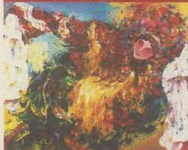
The Drunken Beauty by Liu Linghua