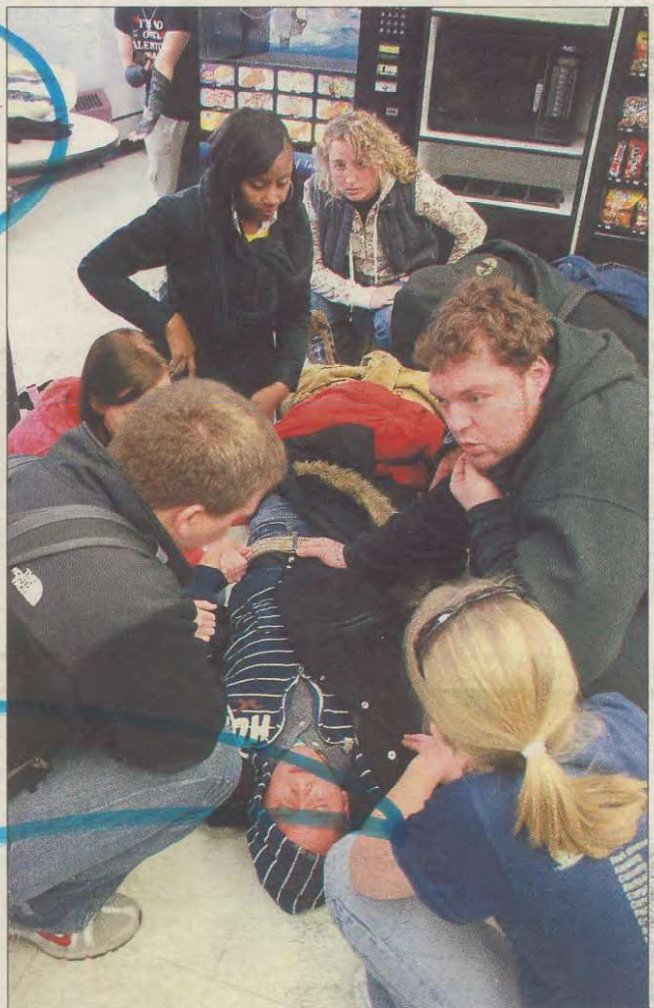
Students help a victim after carrying him from the bloody scene at Cole Hall to nearby DuSable Hall at the Northern Illinois University in DeKalb after a man dressed in black opened fire with a shotgun before killing himself. The victim suffered a gunshot wound to the leg.