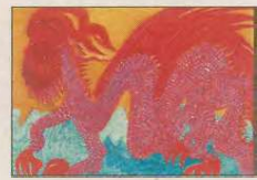
Ancient techniques are used to good effect.

The famous painter/sculptor Andres Alcantara is bringing a brilliant exhibition "Eight Bridges" to Shanghai now. The exhibition is a bridge between Chinese and Spanish culture.